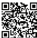
Australian Stamp Variations home page

Many variations are only available in sheetlets or booklets containing multiple stamps and are often sold above face value. The cost does not include the cost of single gummed sheet stamps when issued. Scan the QR code with your mobile cell phone to go to the ASV home page. Find out what Australia Post actually issued each year in my 1966-2008 ASV Catalogue.